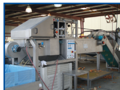
DEMO Machines Available