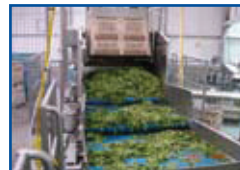
Automatic Bin Dumpers