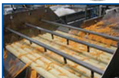
French Fry Sliver Remover