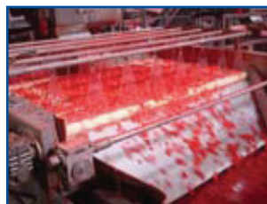
Diced Tomato Sliver Remover