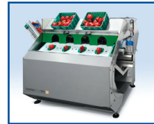
Bell Pepper Corer In-Feed