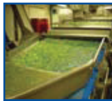
STIR - Continuous Flow Dryer