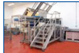
Gentle Bin Systems