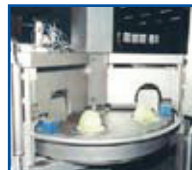
Automatic Cabbage Decor