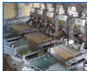
Pistachio Loose Hull Remover