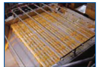
Diced Peach Sliver Remover