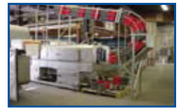
Automatic Crate Washers