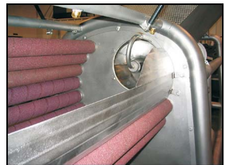
The infeed auger can be seen in this interior view of the low maintenance huller design. Gull wing doors provide easy access.